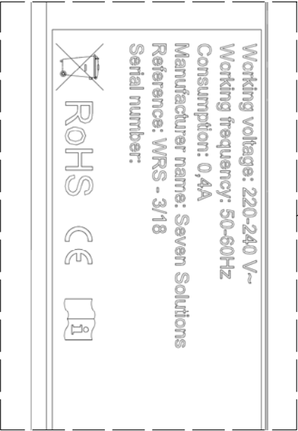
DETAIL 2 E: 1/1